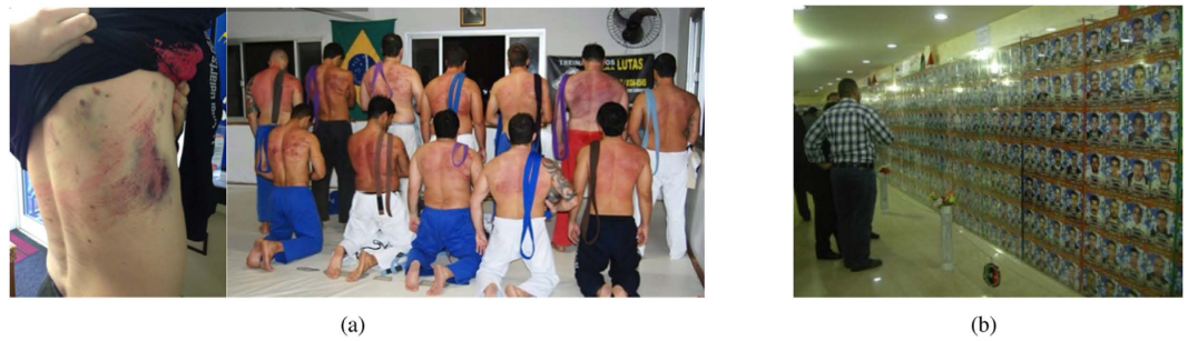
Figure 1. Shared dysphoric experiences. (a) Bruises and welts from Brazilian Jiu Jitsu belt whipping gauntlets. (b) Memorial in Misrata to the thousands of revolutionaries in Libya who laid down their lives in the 2011 uprising.

is a cause of extreme cooperation across cultures, in contrast with the less extreme forms of cooperation motivated by identification (alignment with a group category) and ethnic psychology (the acquisition, storage, and deployment of socially learned group identity markers) 22,24 .